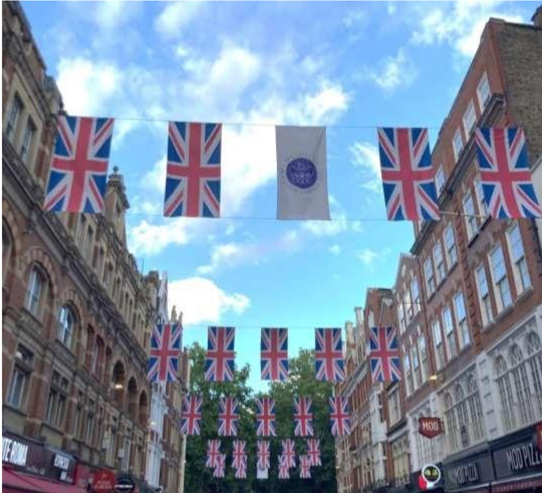
Platinum Jubilee decorations in London's West End to commemorate Queen Elizabeth's 70-year reign

The conference will be held in Abuja during the last week of November. The theme for this year's conference is 'Tax Administration in a Digital Era'.