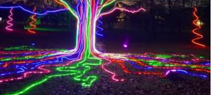
Christmas lights at Royal Botanic Gardens, Kew